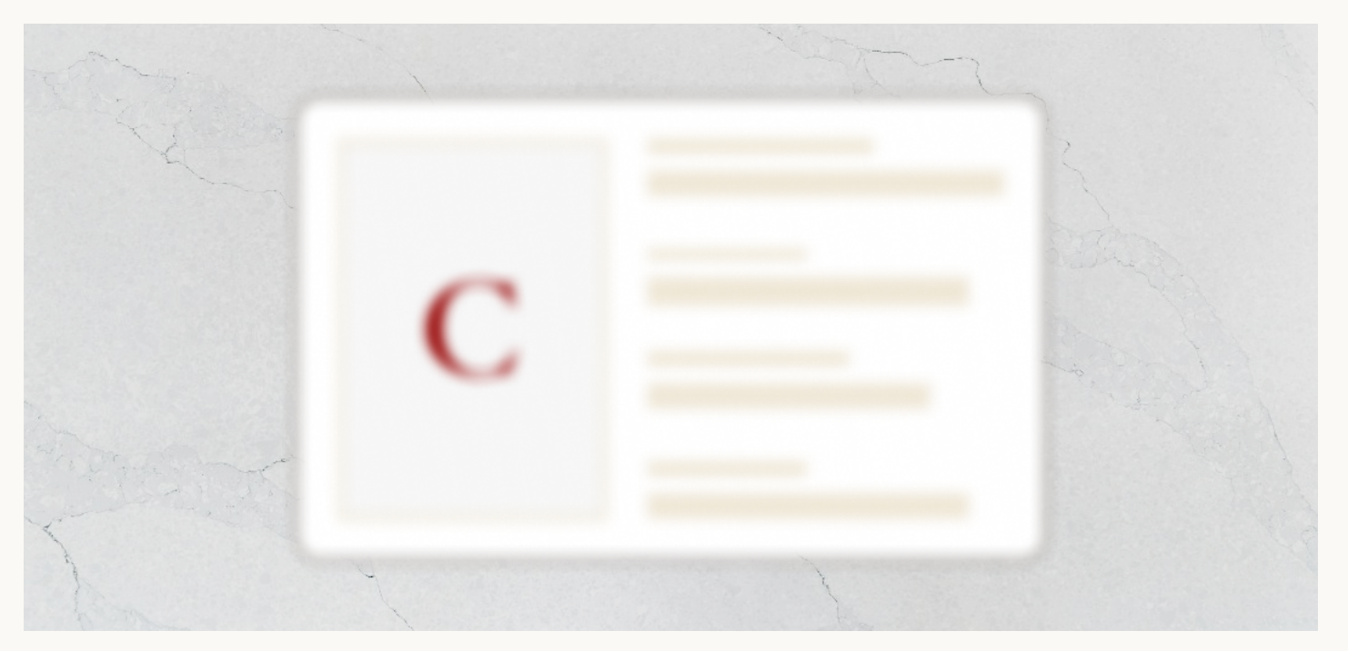
Out of focus/blur